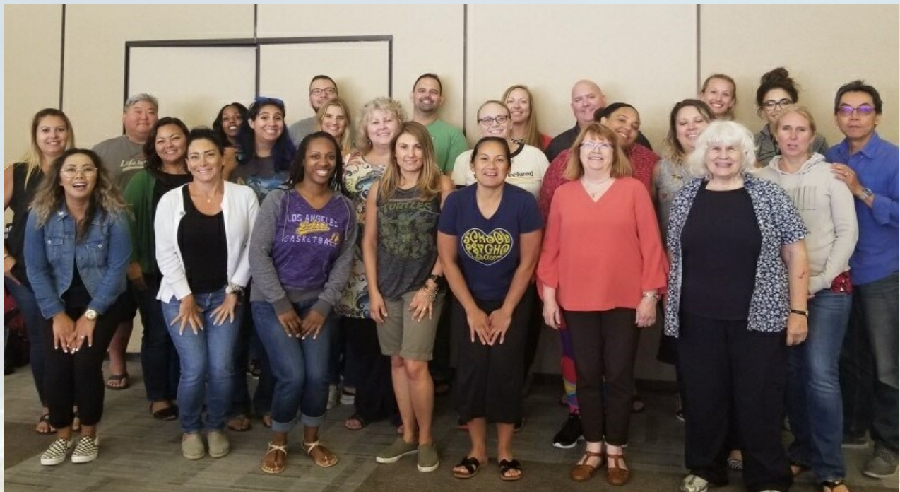
The CASP 2019-2020 Board at their August 2019 Board Retreat.